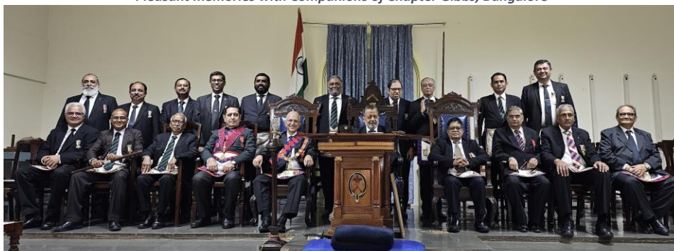
Pleasant memories with Companions of Chapter Gibbs, Bangalore

It was a fascinating experience to reminisce on the ritual's roots in the biblical story of Noah and the Ark, and the degree focusing on themes of faith, survival, and salvation. The Royal Ark Mariner Lodge is a fascinating and symbolically rich component of Freemasonry, focusing on Noah's story as a foundation for teaching moral lessons related to leadership, and perseverance.