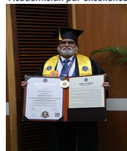
Academician par excellence