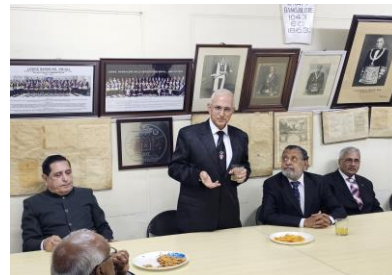
Discussing the finer and intricate nuances of Scottish Freemasonry at the interactive meeting at Bengaluru

During the meeting, it was stressed that the Ark Mariner degree is one of the oldest degrees still practised today, with deep historical and symbolic significance which was explained by elaborating that the ritual reflects on the ideas of salvation, moral fortitude, and the passage through adversity, using the biblical flood as an allegory for life's trials. The symbolic importance of the rainbow as a key symbol stands out in the degree representing the covenant between God and man, signalling hope, renewal, and a promise of peace after the storm.