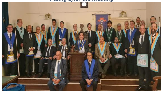
Posing after the meeting