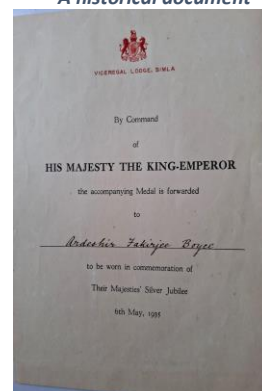
A historical document