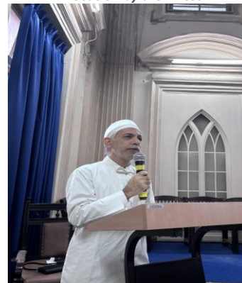
Invocation by the Priest