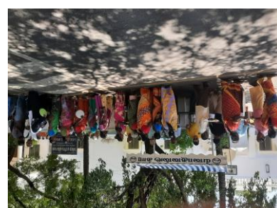
Living up to the ideals of Freemasonry by distributing wholesome food to the needy at the community Kitchen run by our Brethren at Trichy