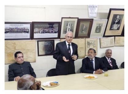
Discussing the finer and intricate nuances of Scottish Freemasonry at the interactive meeting at Bengaluru

During the meeting, it was stressed that the Ark Mariner degree is one of the oldest degrees still practised today, with deep historical and symbolic significance which was explained by elaborating that the ritual reflects on the ideas of salvation, moral fortitude, and the passage through adversity, using the biblical flood as an allegory for life's trials. The symbolic importance of the rainbow as a key symbol stands out in the degree representing the covenant between God and man, signalling hope, renewal, and a promise of peace after the storm.