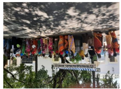
Living up to the ideals of Freemasonry by distributing wholesome food to the needy at the community Kitchen run by our Brethren at Trichy